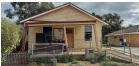
Eugowra CWA rooms following the flood

September 2023 was a landmark moment for Eugowra Branch. Members held the first meeting back in their own rooms since the November 2022 floods destroyed the Central West NSW township.