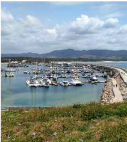
Coffs Harbour from Muttonbird Island

Or you may choose to take the road south to see the beautiful wetlands and boardwalks of Urunga or head inland via Bellingen and up the mountain to the picturesque plateau of Dorrigo.